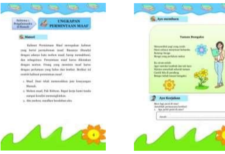
Figure 6 Figure 7